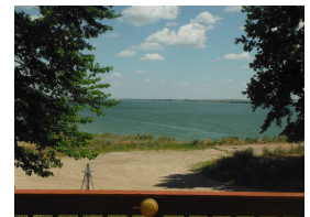
Great view steps to beach