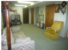
family rm 25 x 11