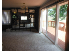
Living rm doors to deck