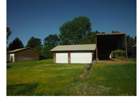
Carport 12'x 58' x13'tall