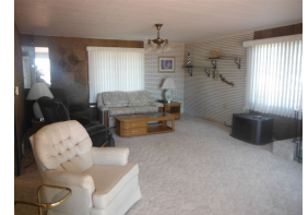
living rm 15'6 x 23'6