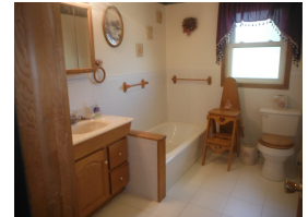
Bath main level