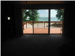
Veiw from Living room