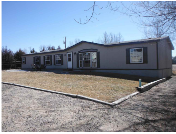
14 Peterson's 2