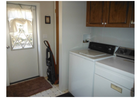
Laundry area/back door