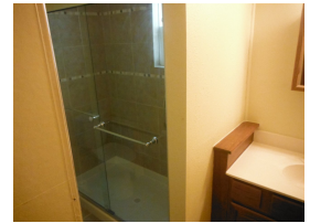
New tile shower master br