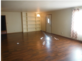
Living rm/dining rm