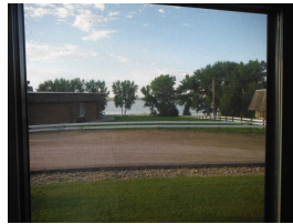
View from Master bedroom