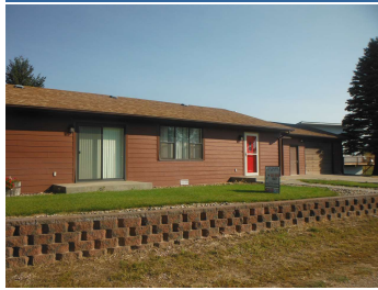
15 Albee's 2