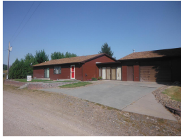
24 x 24 garage