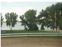
View from patio