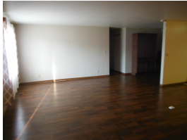
2nd view living rm