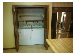
Laundry off Kitchen