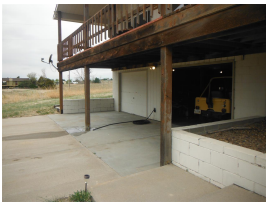
720 Sq. ft. garage space