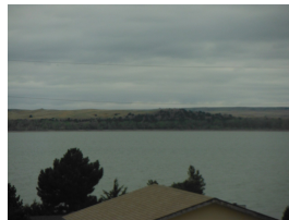
Close access to beach