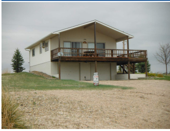
Lot 221 & 222 Lakeshore