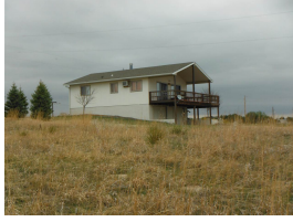
View of lot 222