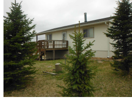
View of back yard