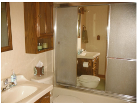
Main floor bath