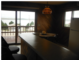
Great view of the lake