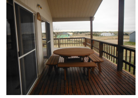
Over 500 sq. ft. of deck