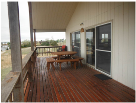
Room for everyone !!