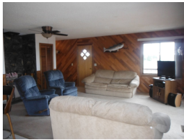
19'9" x 14'10" living rm