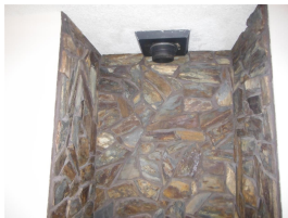
Wood stove/insert area