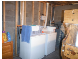
Laundry area in basement