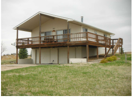
View of east side of home