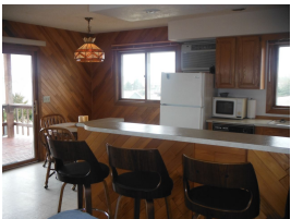
Eat in Kitchen w/view