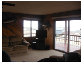
Sliding doors onto deck