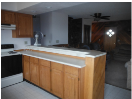
Food prep area!