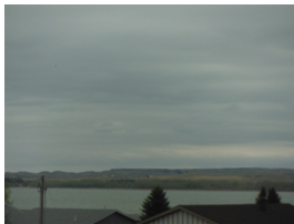
View from deck