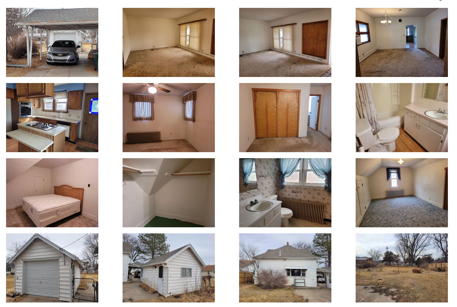
Address: 402 4th Street