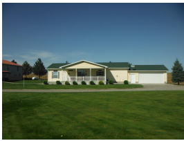
2,752 sq.ft living space