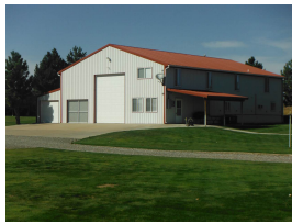
Full living quarters