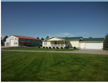
9 Lakeview Estates

MLS # 25471 Asking Price $550,000 Status New Listing Comment Status ACTIVE Class RESIDENTIAL Type LAKE PROPERTY Area LAKE Address 9 Lakeview Estates City Lemoyne State NE Zip 69146 Sale/Rent For Sale IDX Include Y