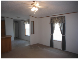
LIVING ROOM 14'3" X 13'8"