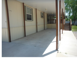
COVERED PATIO OR PARKING