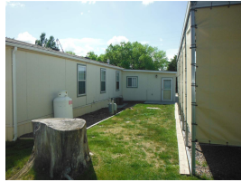
FISH CLEANING STUMP