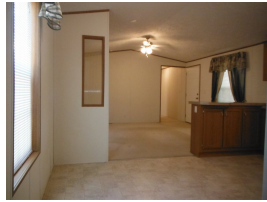
ANOTHER VIEW LIVING ROOM