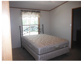
MASTER BDRM 10'2"X14'3"