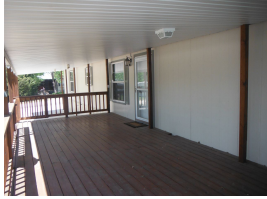
EAST VIEW OF DECK