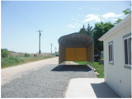
12' X 36' CARPORT