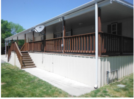
VIEW OF DECK FROM EAST