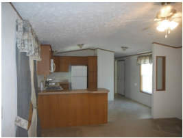
12 X 14'3" KIT/DIN COMBO