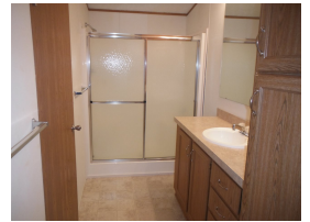
MASTER BATH 5'2"X4'10"