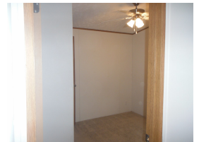
3RD BDRM 10'7"X7'8"