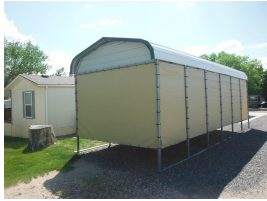
12' X 36' CARPORT