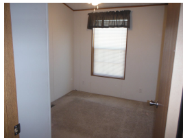
2ND BEDROOM 8'10"X10'3"