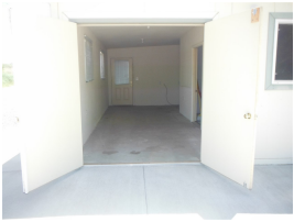
16' X 23' ADDITION