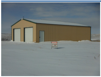
30' x 48' Cleary Building

MLS# 23634 $50,000 Asking Price Status New Listing